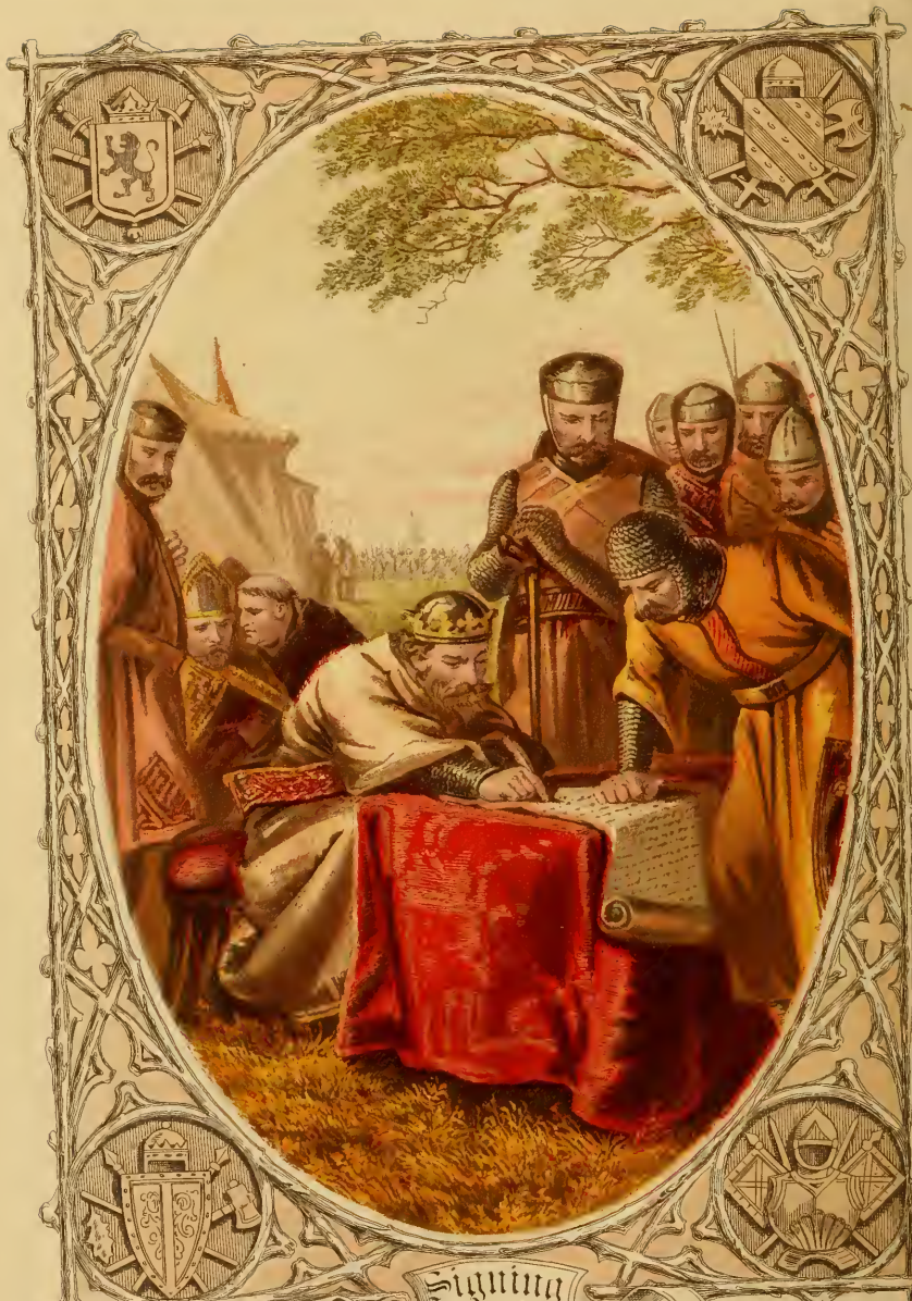
Signing of Magna Charta